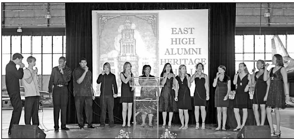
East High Angelaires performing at Wings Over The Rockies.

(Continued from Page 1) wood (who graduated more than a century ago in 1879), and world renowned contemporary inductees like movie actor Don Cheadle.